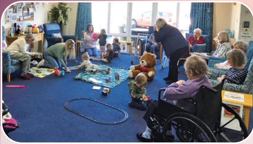
Ritson Lodge Care Home - Barchester Healthcare. Bringing younger and older generations together to engage and interact.