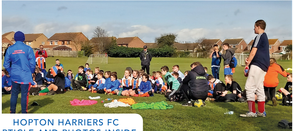
HOPTON HARRIERS FC ARTICLE AND PHOTOS INSIDE