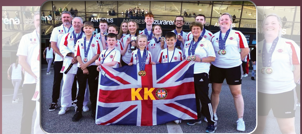
Phoenix Karate School awards - see inside for details Hopton-on-Sea Parish Council wish all readers a Happy New Year