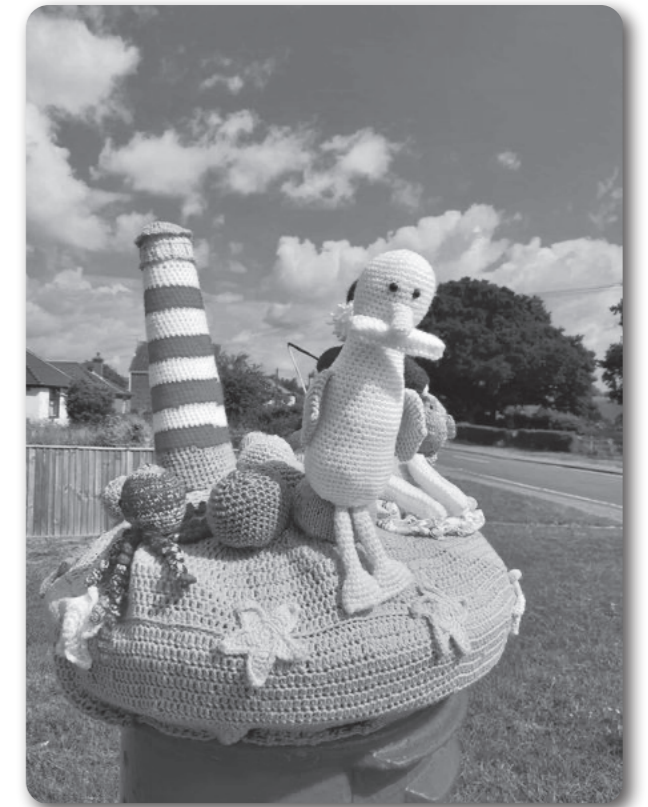
Hopton's Yarn Bombers have been putting their skills to good use again.

Send your entry to hoptonparishclerk@hotmail.com or drop your wording to the Office at the Village Hall by the 12th of the month, for inclusion in the following monthly edition.